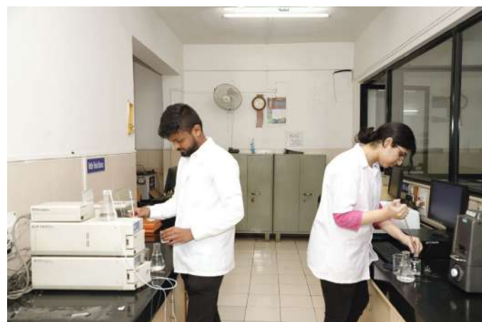
Instrument Room Equipped with Sophisticated Instruments