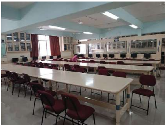
Library Reading Hall