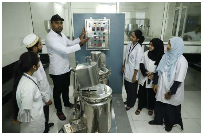
Machine Room with Pilot Plant Setup