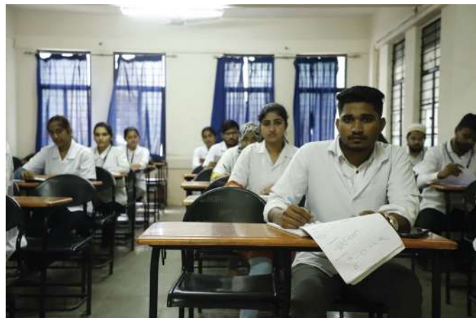
Classroom with ICT Facilities