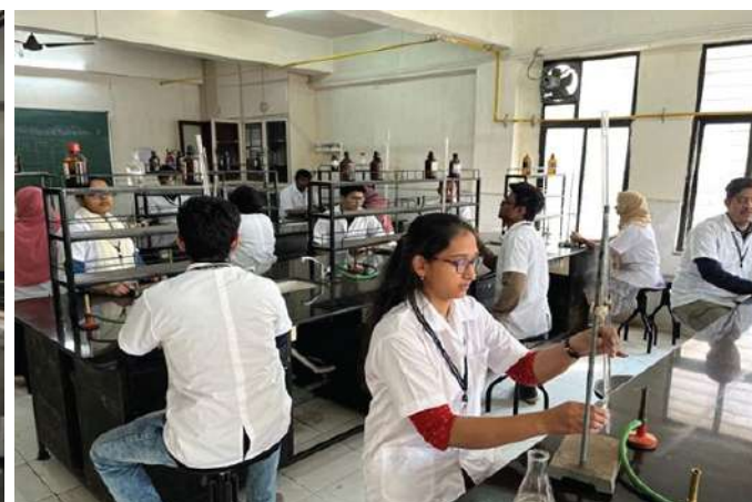
Well Equipped UG & PG Labs