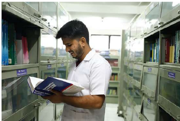
Library with Excellent Collection of Books