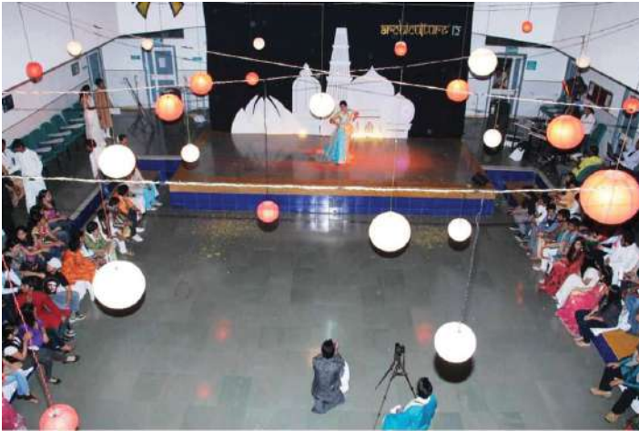
Annual Cultural at Art Court