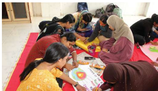
Teaching Aid Workshop