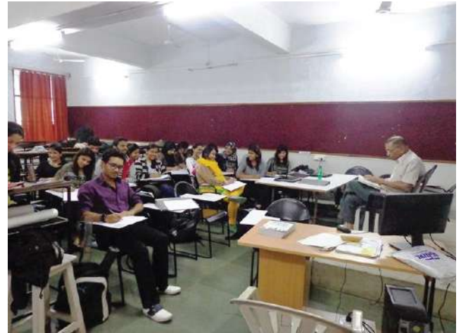
Hands-on Training Sessions