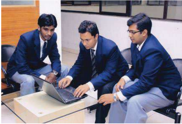
Students Counselling Area