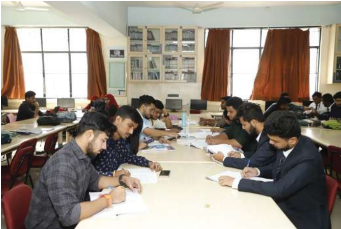
Library Reading Room