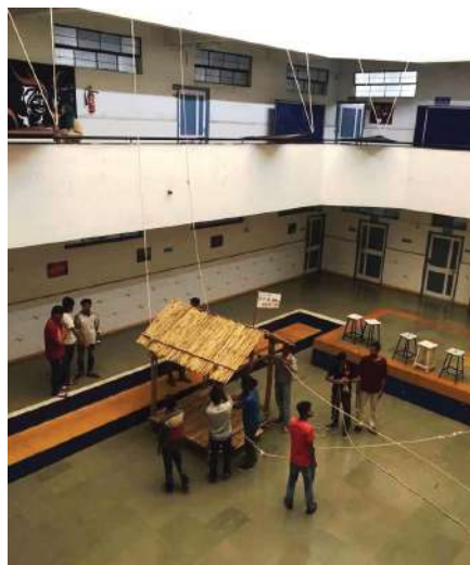
Bamboo Construction Workshop