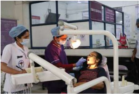
Dental Hospital & Research Centre